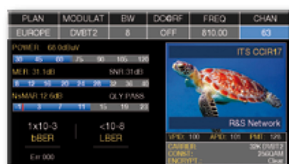
New Measures & Pictures Super fast