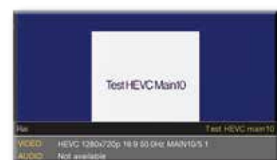
DVB-T2 HEVC Measurements and Pictures