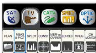
New Icon Navigation Menu