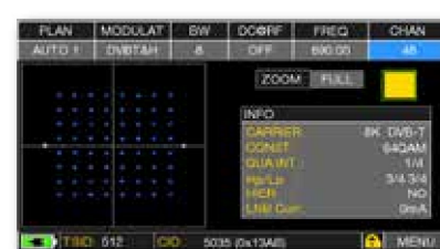
New constellation diagram