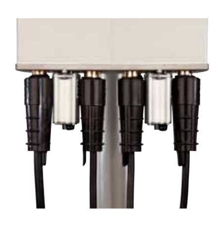
Multiple 3M<sup>™</sup> Slim Lock Closures installed on a Multiple In Multiple Out (MIMO) antenna.

Air is displaced around protected interconnections using a highly compliant sealing gel technology providing a robust sealing interface. This closure can be opened and reused without disconnection of the network, thereby avoiding signal interruptions and additional replacement costs.