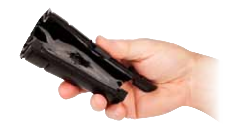
3M™ Slim Lock Closure for wireless applications