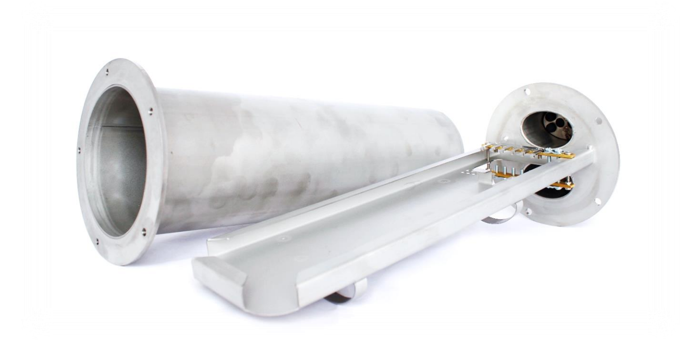
Inner frame of the Nestor St Closure S 48F Mech.