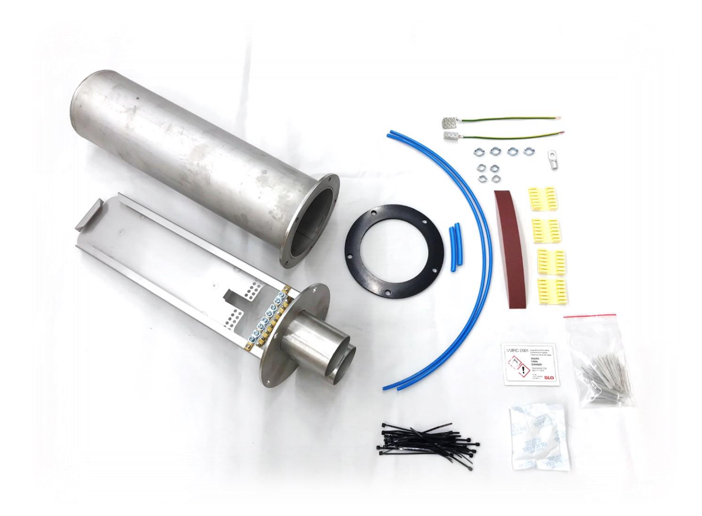
Nestor St Closure S 48F Mech basic assembly.