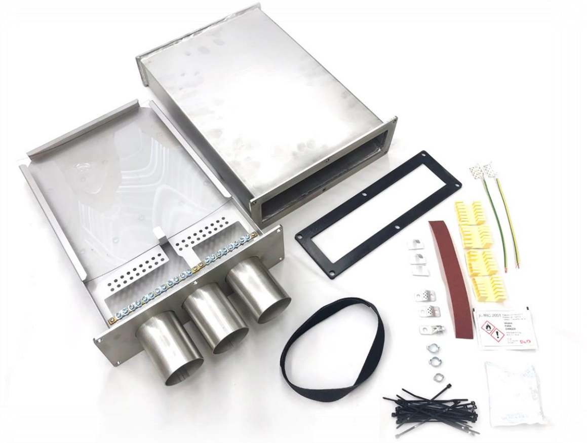
Nestor St Closure M 96F Mech basic assembly.