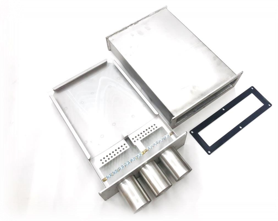
Inner frame of the Nestor St Closure M 96F Mech.