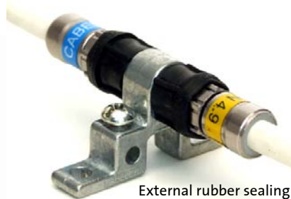
External rubber sealing mounted on Self-Install™

- is the perfect companion to go with a couple of Self-Install™ connectors for home installations. The pocket installer combines a RG6/59 cable stripper with mechanical stop for proper stripping length and an 11 mm spanner. The Pocket installer makes the cable preparation much easier and precise, while the spanner can be used for proper tightening.