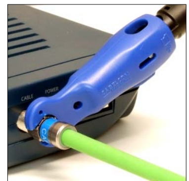
Proper tightening with the Pocket installer