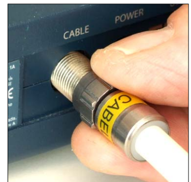
Self-Install™ with finger friendly nut

Use the Self-Install™ for CATV, satellite receivers, cable modems and other set-top box applications. The waterproof versions can be used for any outdoor application such as parabolic dishes etc.