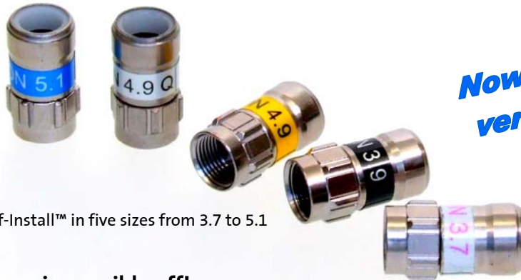
Self-Install™ in five sizes from 3.7 to 5.1