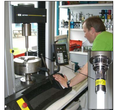
Computer controlled test of the pull strength