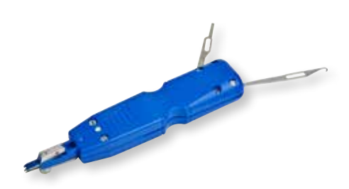
3M™ IDC Termination Tool SOR OC PKSI-S with disconnection hook