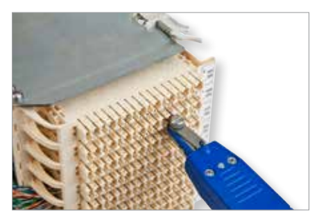
3M^{\infty} IDC Termination Tool SOR OC SI-S being used on the 3M^{\infty} Next Connect High Density Splitter Block NC-SP