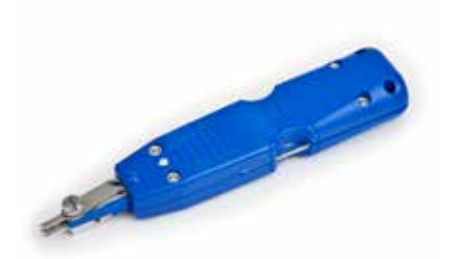
3M™ IDC Termination Tool SOR OC SI-S