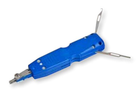
3M<sup>™</sup> IDC Termination Tool SOR OC SI-S with disconnection hook