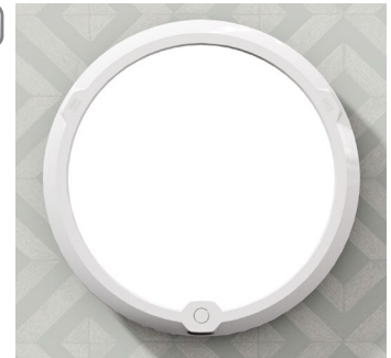
LedgeCircle without PIR sensor

120420 Remote control HRC-05 For PIR MinMaxOff