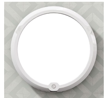
LedgeCircle with PIR sensor

120420 Remote control HRC-05 For PIR MinMaxOff